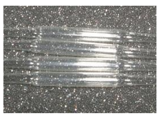
PA tubes stretched on two sides

The GEMINI can be used to process any type of material, such as PA, PTFE, PUR, PET.